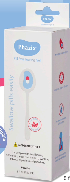
5 fl oz tube